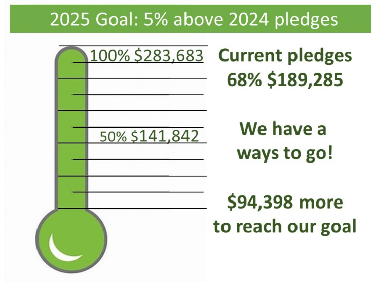
Balance Statement Summary 2024-10-31 v1 brief