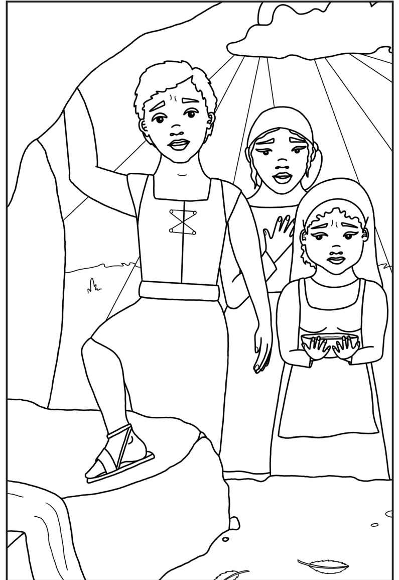
Color in the story of Peter and the empty tomb.

LUKE 24:1-12 Peter runs to the empty tomb. MAIN IDEA: God made all our feelings.